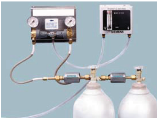
Dual Cylinder Configuration (CO 2 system with CO 2 dual tank switchover regulator shown)

CO 2 -10 Automatic dual tank switchover with gauges for nominal cylinder pressure without pressure regulator. Used in conjunction with CO 2 -5.